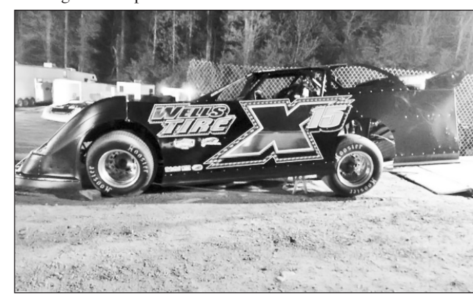
Shawn Chastain's X15 car getting ready for the main event at Tri-County last weekend.

The Blue Ridge Motor Sports Park scheduled for June 9 was rained out.